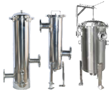
Multy Cartridge Filter Housing