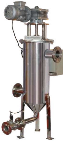
Self Cleaning Filter