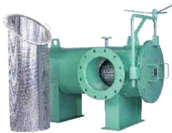
Horizontal Basket Housings