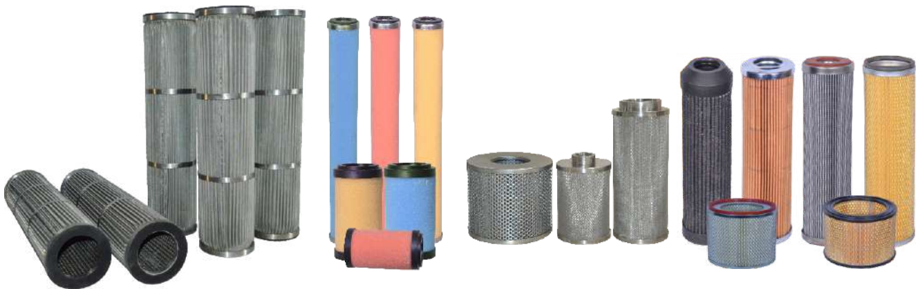
Air Filter Element | Suction Filter Elements | Hydraulic Oil Filter Elements