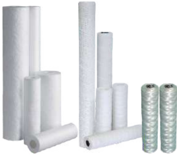
PP Spun, PP Wound, GF Wound