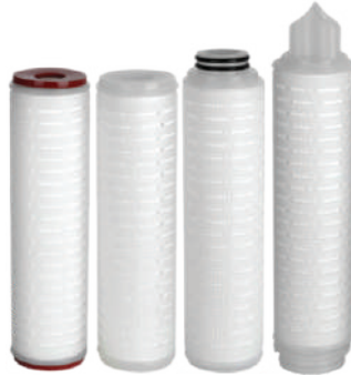
PP Pleated / PTFE Pleated Filter