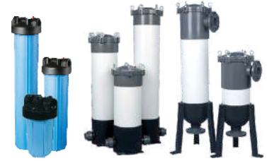
PP &amp; UPVC Filter Housing