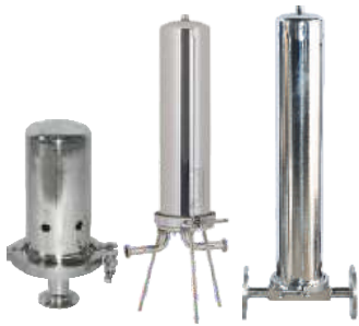
Single Cartridge Filter Housing