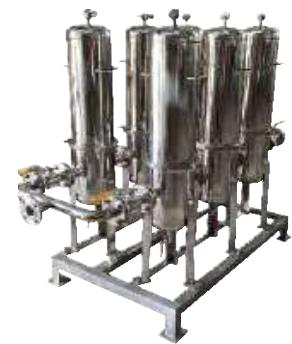
Multy Stage Systems