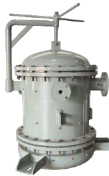
PP/FRP Lined Filter Systems