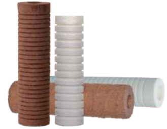
Cellulose Resin Bonded Filter