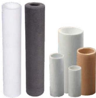
Sintered PP &amp; Ceramic Filter