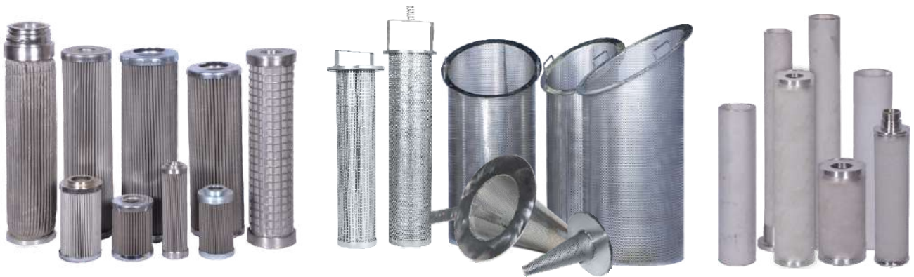
SS Wire Mesh Filter Element | Basket Filter Element | Sintered Powder Filter Element