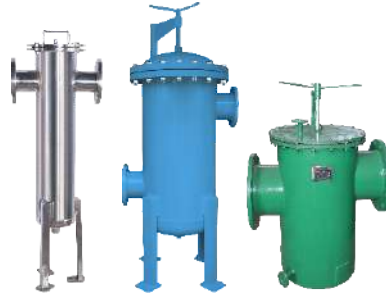
Basket Filter Housings