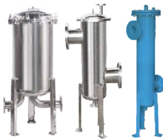
Bag Filter Housings